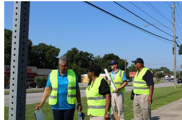
Evaluating Raleigh Blvd