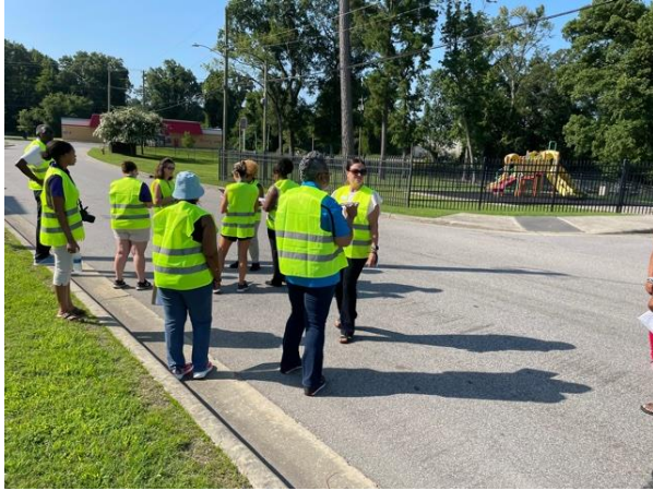
Pinehurst Dr near the playground