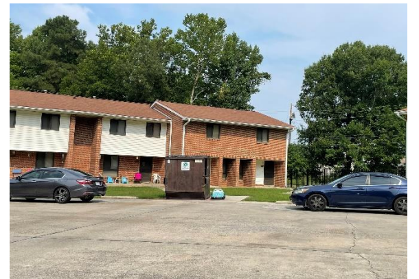
Dumpster in center of neighborhood