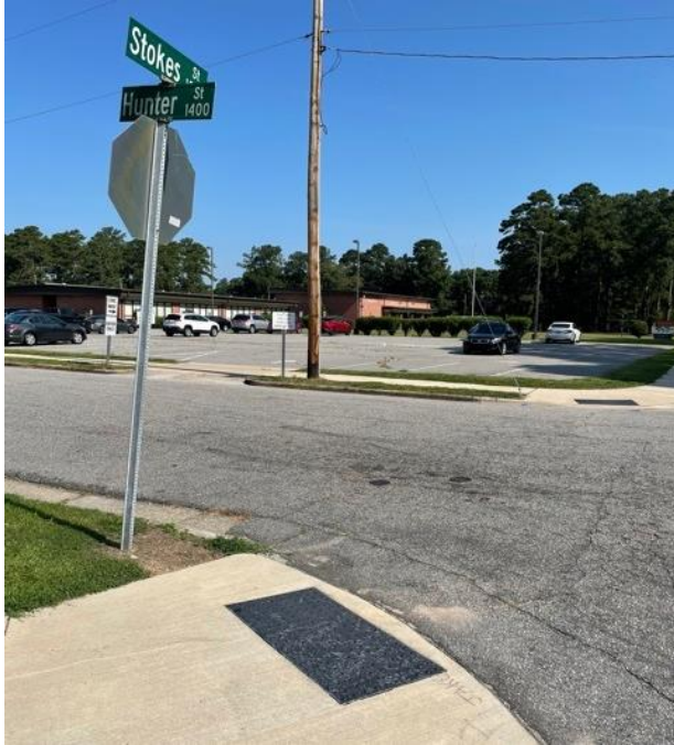
Intersection without crosswalk at Baskerville Elementary