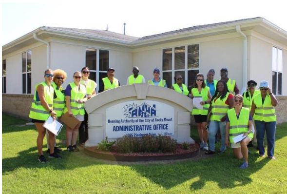
Walk Audit participants