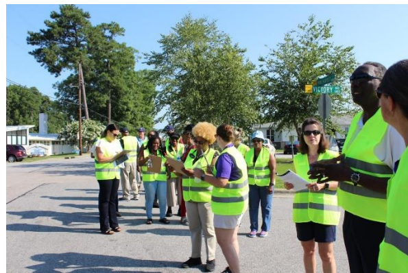
Evaluating Pinehurst Dr near the playground