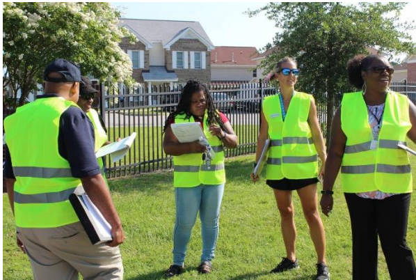
Evaluating intersection at Pinehurst Dr and Raleigh Blvd