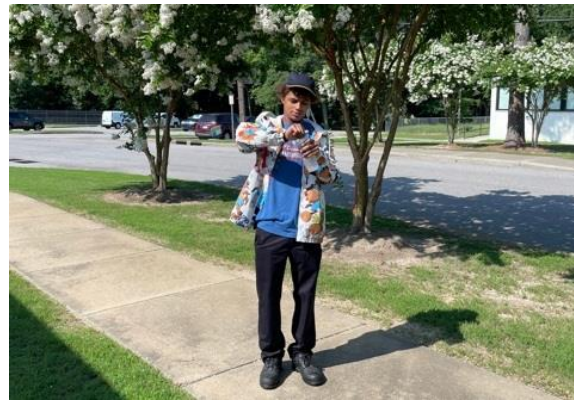
Neighborhood resident walking to work