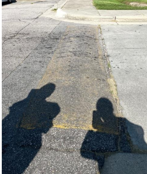
Speed bump with faded paint