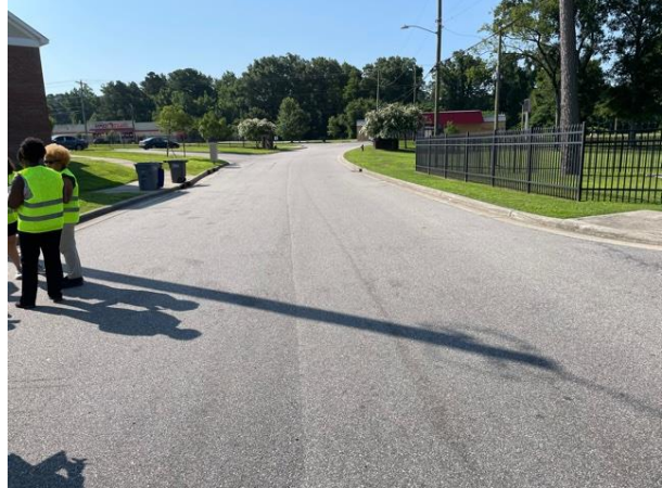
Potential location for crosswalk to playground and Children at Play sign on Pinehurst Dr